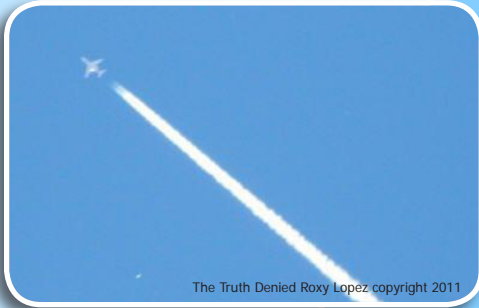
The Truth Denied