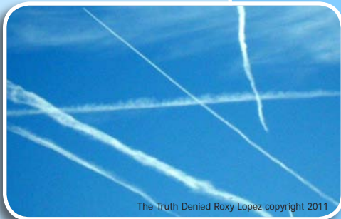
The Truth Denied Roxy Lopez copyright 2011

Notes: Contrails fade away quickly; the reactions of dissipation begin immediately as the particles leave the aircraft engine; different factors such as humidity, temperature and pressure affect the speed of contrail dissipation.