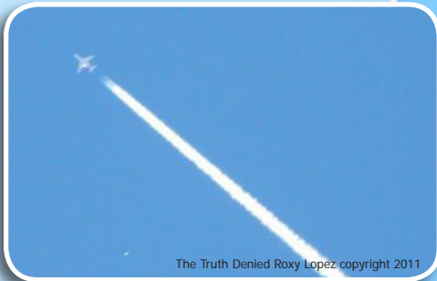
The Truth Denied