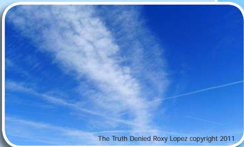
The Truth Denied