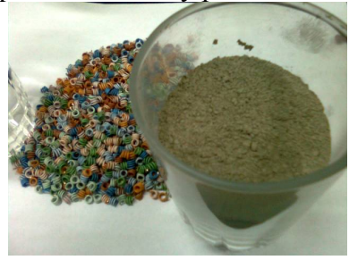
Add some water, mix it well: